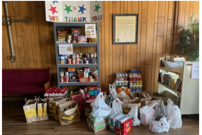
We collected 2,025 non-perishable food items - thank you YACC!