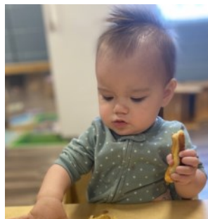
Busy, happy Play and Learn students